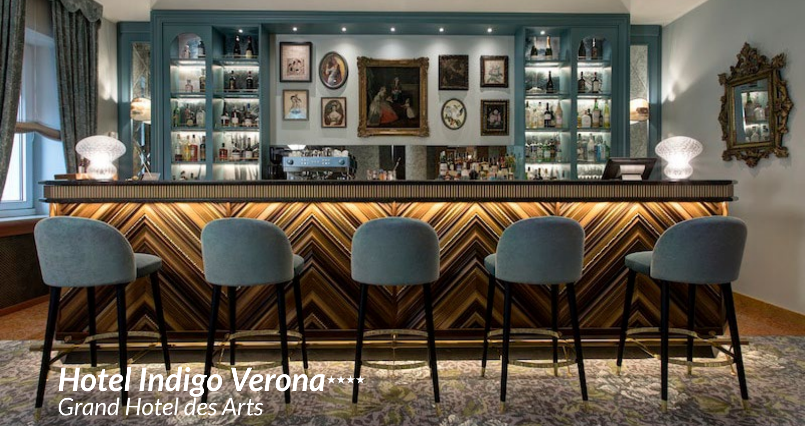
Hotel Indigo Verona**** Grand Hotel des Arts